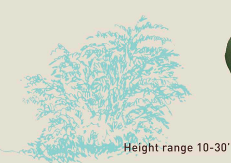
Height range 10-30'