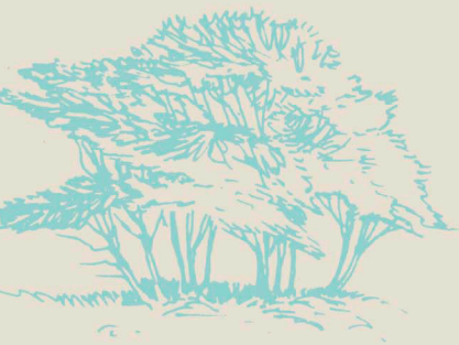
Height range 20-35'