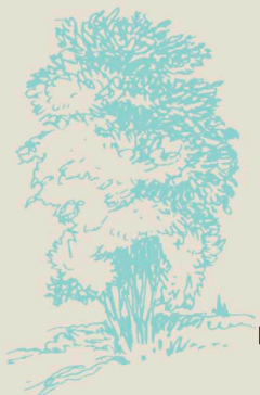
Height range 6-10'