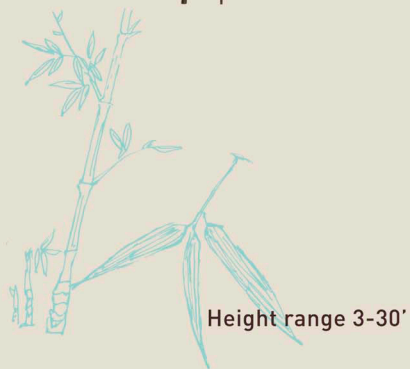
Height range 3-30'