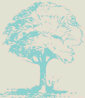
Height range 40-90'