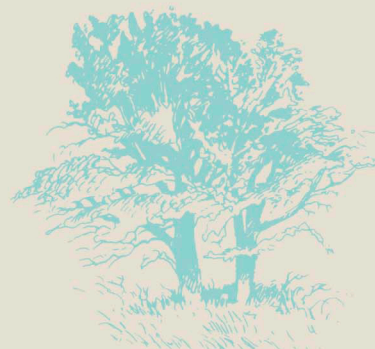
Height range 30-70'