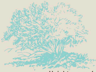
Height range 4-12'