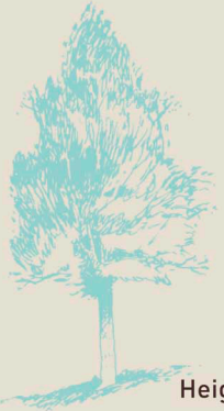
Height range 30-100'