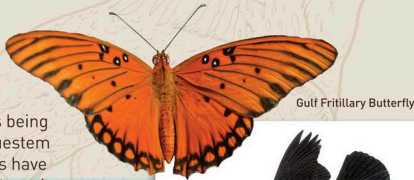
Gulf Fritillary Butterfly