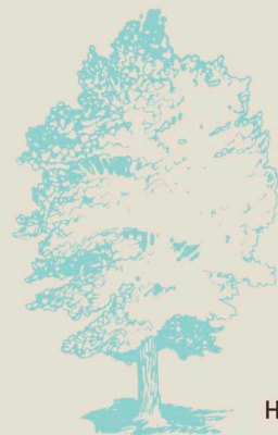
Height range 60-100'