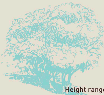
Height range 30-60'