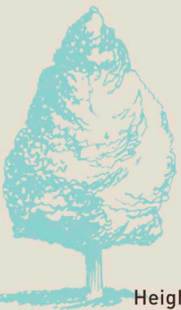
Height range 80-140'